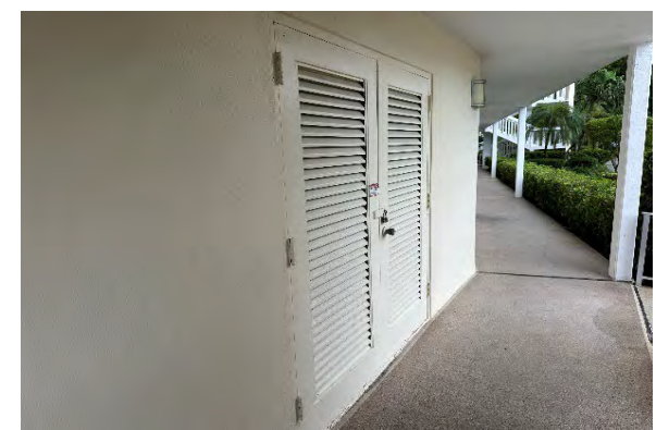
Building Electrical Panels and Common Area Windows/Doors

Grantham A Condominium Association, Inc.