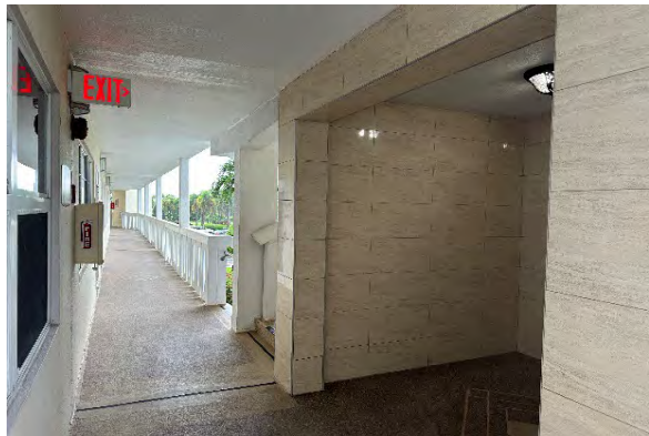
Condo Building Exteriors

Grantham A Condominium Association, Inc.