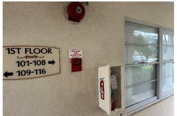
Building Flat Foam Roofing System / Baluster / Fire Protection Systems

Grantham A Condominium Association, Inc.